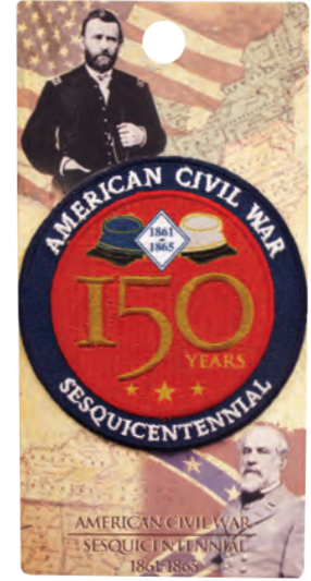
Item #27657 Patch $2.75