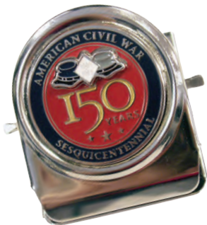
Item #27627 Clip Magnet $3.25