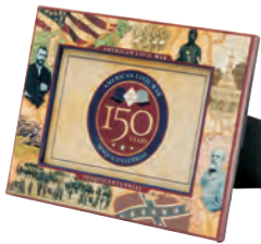
Item #461 2x3 Magnetic Photo Frame $2.00