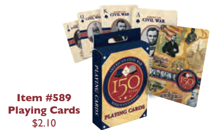
Item #589 Playing Cards $2.10