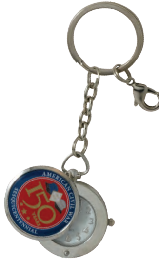
Item #195 Swivel Clock Keychain $5.25