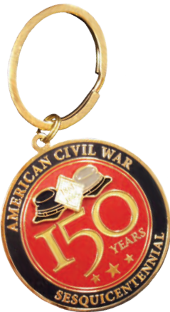
Item #27641 Keychain $2.75