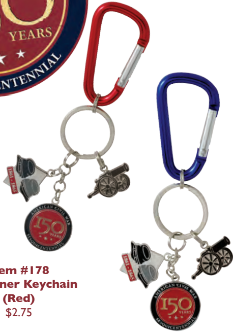
Item #178 Carabiner Keychain (Red) $2.75