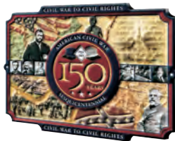
Item #486 2x3 Collage Magnet $2.00