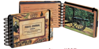
Item #837 Photo Journal $3.25