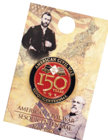
Item #27601 Lapel Pin $2.50