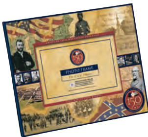
Item #849 4x6 Photo Frame $3.25