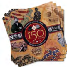
Item #27455 Coasters $3.25