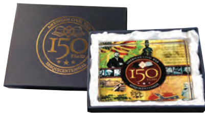
Item #98 Photo Crystal $10.75