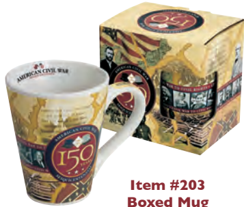
Item #203 Boxed Mug $3.50