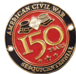
Item #27682 Walking Stick Emblem $2.50