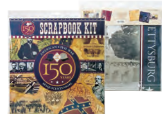
Item #550 Scrapbook Kit $4.25