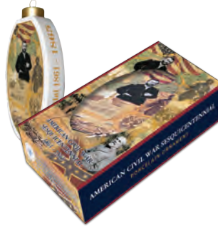
Item #27653 Porcelain Ornament $4.75