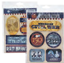
Item #491 Scrapbook Accent Kit $3.00