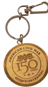
Item #481 Madera Keychain $2.75